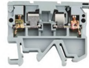
LTU3 RD (JXB-RD)