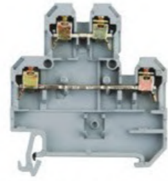
LTU3 4/35S1 (JXB-4/35S1)