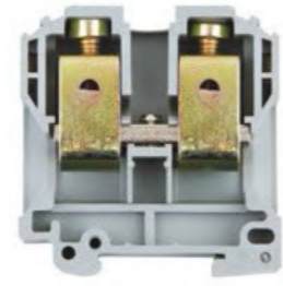
LTU3 70/35 (JXB-70EN)