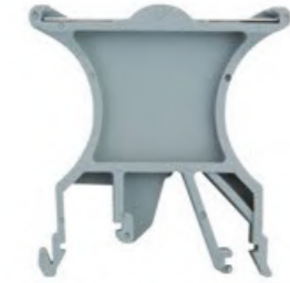
LTU3 B (JXB-B)